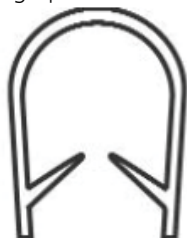
Edge protection big